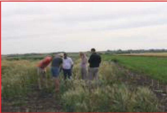
Below: Your Directors inspect new varieties under consideration for advanced testing.